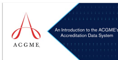
An Introduction to the ACGME Accreditation Data System