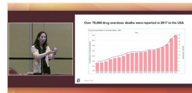
Addressing the Opioid Epidemic: The Responsibility of Physicians