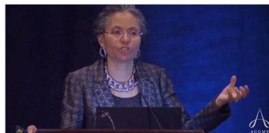
Achieving Health Equity: Tools for a National Campaign Against Racism