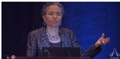
Achieving Health Equity: Tools for a National Campaign Against Racism