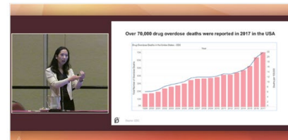
Addressing the Opioid Epidemic: The Responsibility of Physicians