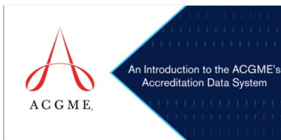
An Introduction to the ACGME Accreditation Data System